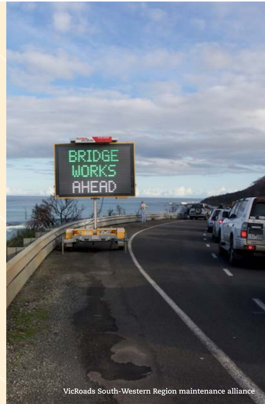
VicRoads South-Western Region maintenance alliance